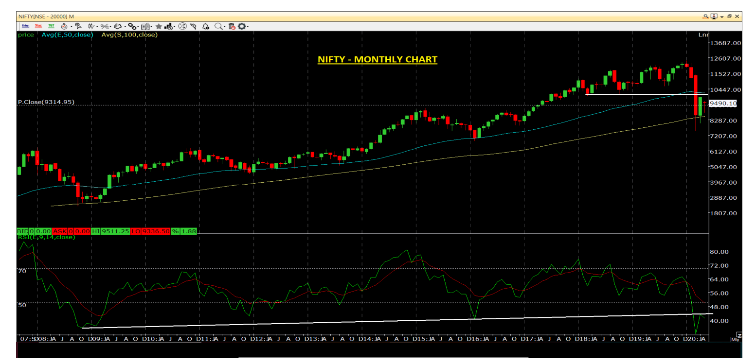
NIFTY 50 - 28 MAY 2020 MONTHLY CHART