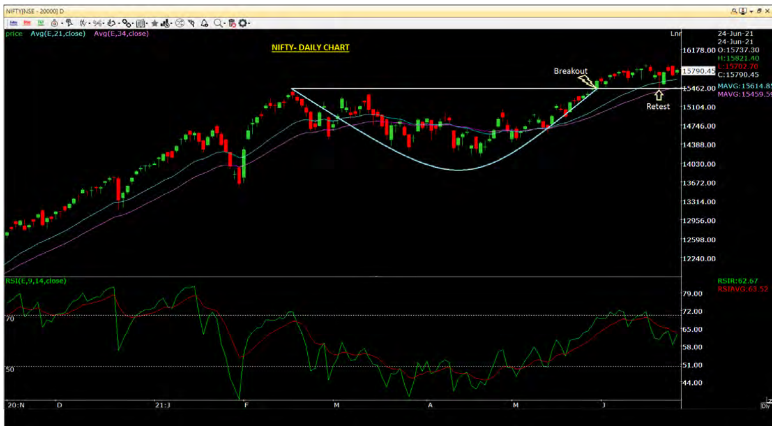
NIFTY 50 - 24-JUNE 2021 DAILY CHART