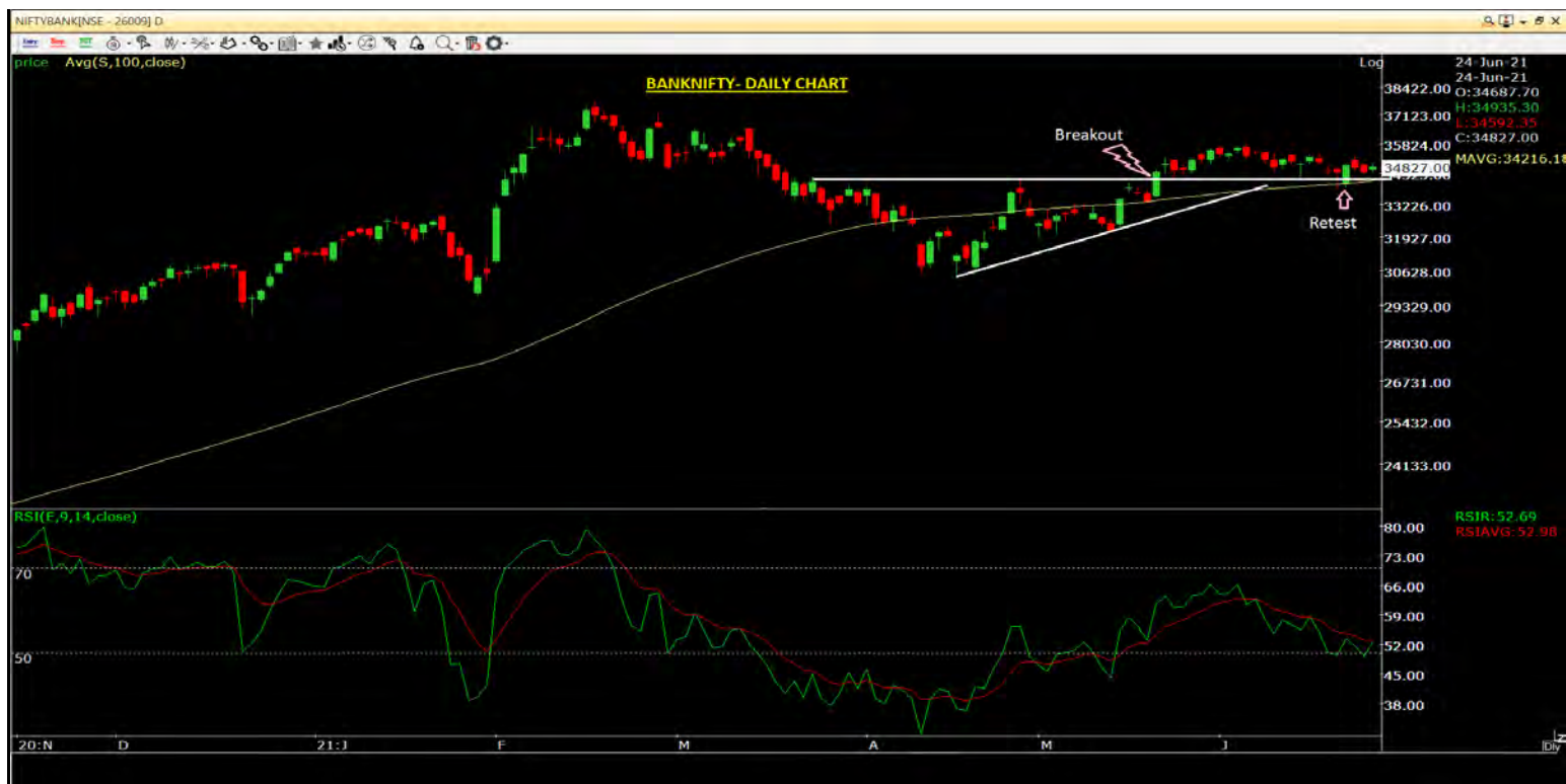
BankNifty- Daily Chart